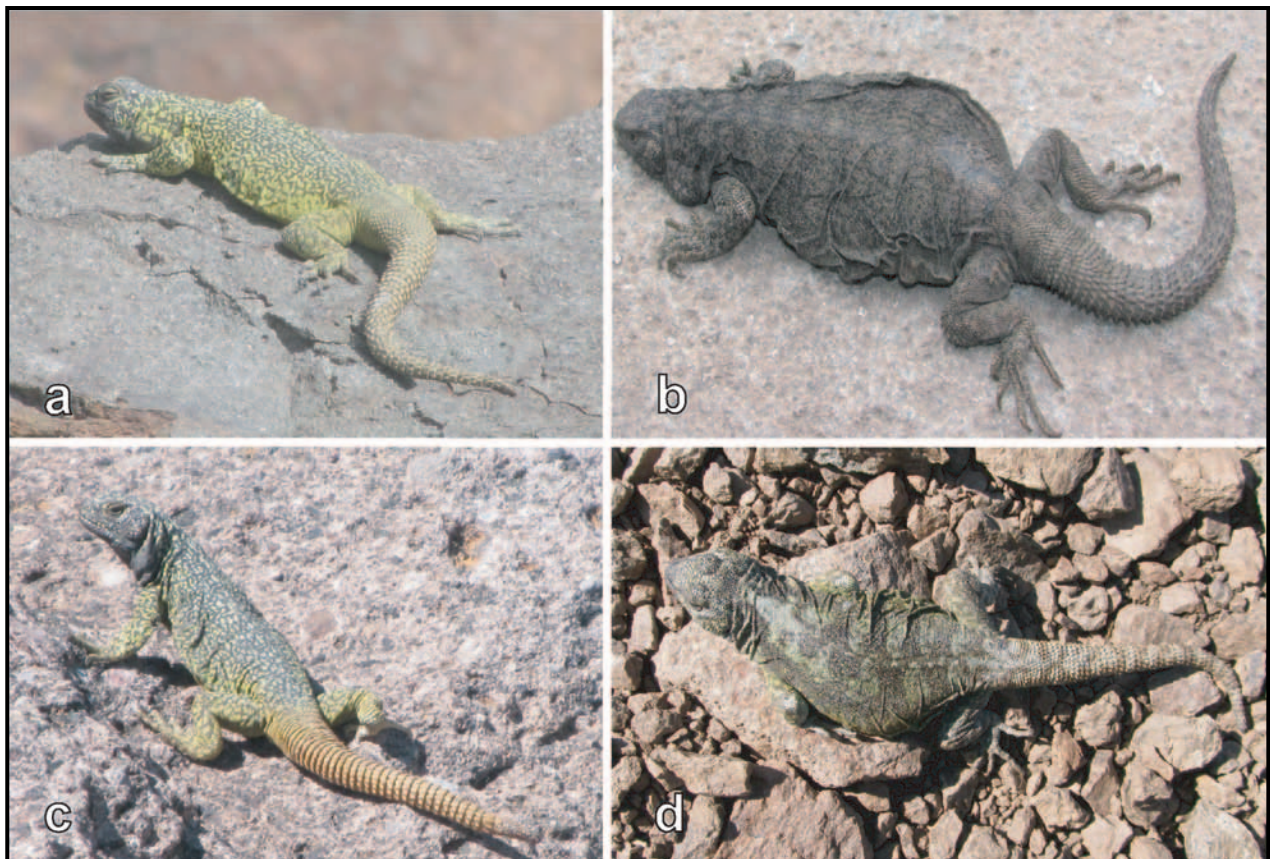
Figure 1. Dorsal view in life of some specimens studied. a) P. damasense (Holotype, SVL= 105.1 mm). b) P. damasense , (Female SSUC Re 0410; SVL= 112.6 mm). c) P. maulense , (Male topotype MZUC 35960; SVL= 92.8 mm). d) P. darwini , (Male, SSUC Re 125; SVL= 86.8 mm).

From P. “adrianae” , it differs in that female of this species have no precloacal pores or dark bars on the flanks. Females of P. “adrianae” have white on the sides of head (“white face”). The preocular scale