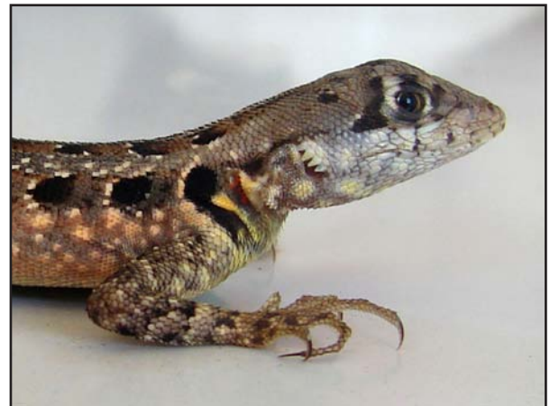
Figure 1. Tropidurus cocorobensis (LPE 1949), municipality of Floresta, state of Pernambuco, Brazil.

Comments. — Tropiduridae is a reptilian family with a large number of known species among the neotropical lizards (Torres-Carvajal, 2004). The genus Tropidurus occurs from southern Venezuela east through the Guianas to northeastern Brazil, from there west south of the Amazon region to eastern Bolivia, extreme northern Uruguay, and central Argentina (Frost et al. , 2001). In Brazil, there are 36 species of tropidurids, 18 of which belong to the genus Tropidurus (Bérnils and Costa, 2011). Currently, this genus is subdivided into four species groups: T. spinulosus , T. torquatus , T. bogerti , and T. semitaeniatus (Frost et al. , 2001). The Tropidurus torquatus group was revised by Rodrigues (1987), whose complex of species was well-defined through the geographical distribution and morphology based on the mite pockets and skin folds in the three major areas of the body (neck, axillary, and inguinal regions). Among the Tropidurus of the torquatus group, T. cocorobensis Rodrigues, 1987 (Fig. 1) is a psammophilous lizard, endemic from the Brazilian Caatinga. It was described from the municipality of